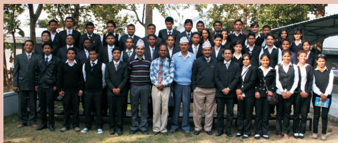
42 B.Sc. (Forestry) students accompanied by their faculty and support staff from Tribhuwan University, Institute of Forestry, Hetauda Campus, Pokhara, Nepal on February 22, 2012.