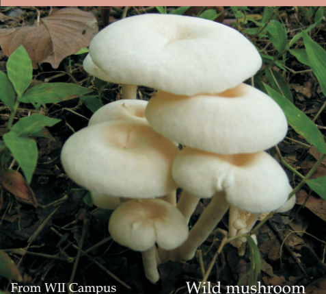
From WII Campus