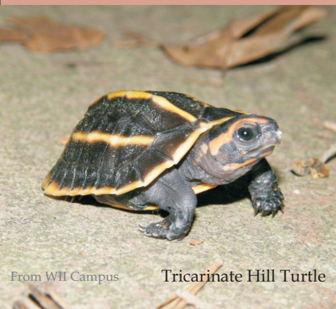
From WII Campus