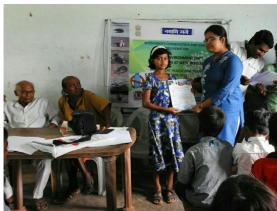
Figure: Celebration of World Environment Day