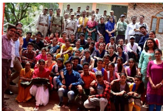
Figures (i) Registration of participants (ii) Different target groups