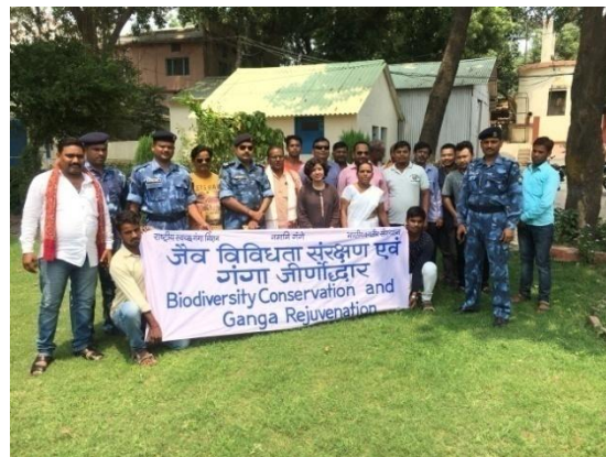
Figure: (i) Presentation session (ii) Group photo with participants