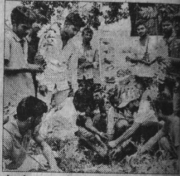
पौधारोपण करते छात्र.