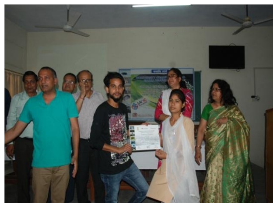
Figure: (i) Plantation by participants (ii) Certificate distribution