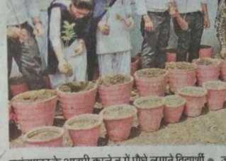
बुलंदशहर के आइपी कालेज में पौधे लगाते विद्यार्थी