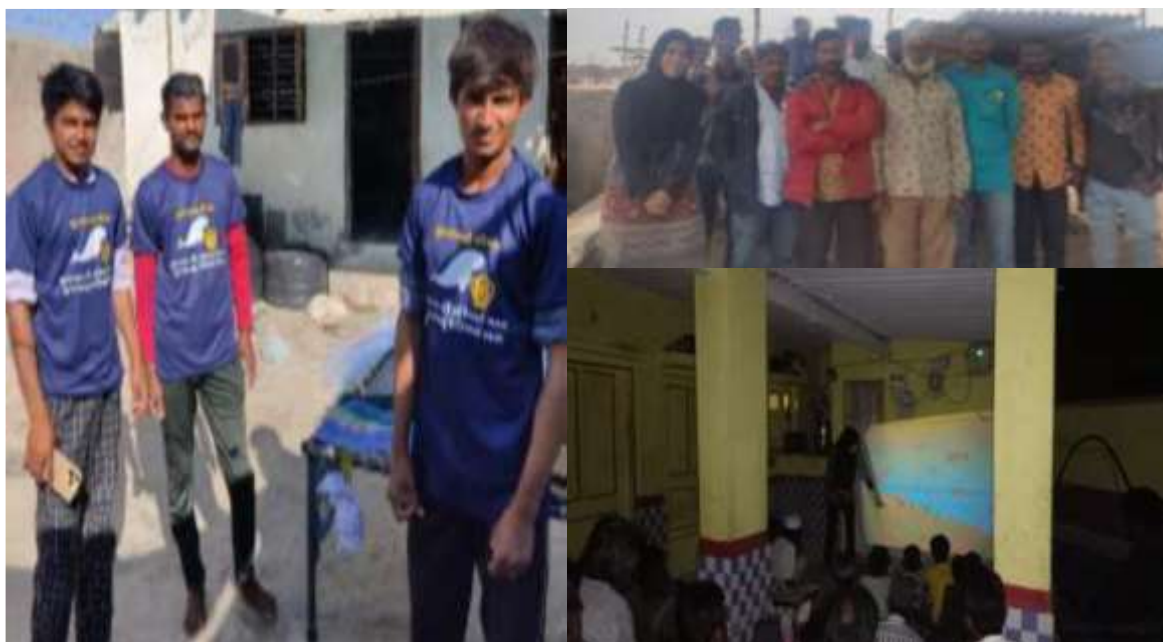
Figure 1. Glimpse of Interview surveys and Community interaction with the Fisher community

Between the 14 th to 29 th of February 2024 interview surveys were conducted at Bet Dwarka and Arambhada village with fishermen. This Survey and Community interaction involved approximately 54 fishers. The surveys were designed to inform about the Go-Slow zones for fishers in the core Dugong areas, and for current/historical Dugong sightings. Winter fishing areas, techniques, and catch were discussed most fishers now avoid fishing in the Dugong core areas from the fear of GJFD. They were well aware of Seagrass meadows but had not sighted any Dugong near Okhari area where they fish. Okhari is outside the core Dugong area. New distributional record of Halophila beccarri from Bet Dwarka island was reported by a fishermen community. Throughout all programs and one-to-one interview surveys, Go-Slow zones near channels, regions to avoid anchoring in meadows, tidal awareness and habitat use of Dugongs was informed.