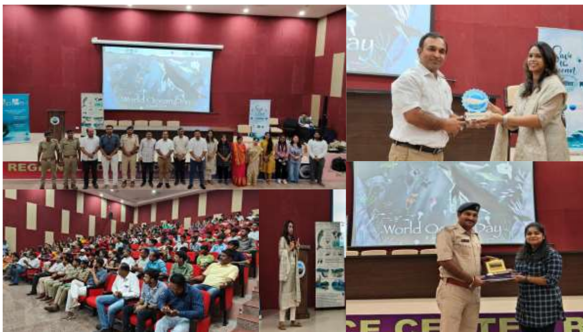
Figure 7. Talk on World Ocean Day 2024 at RSC Bhavnagar