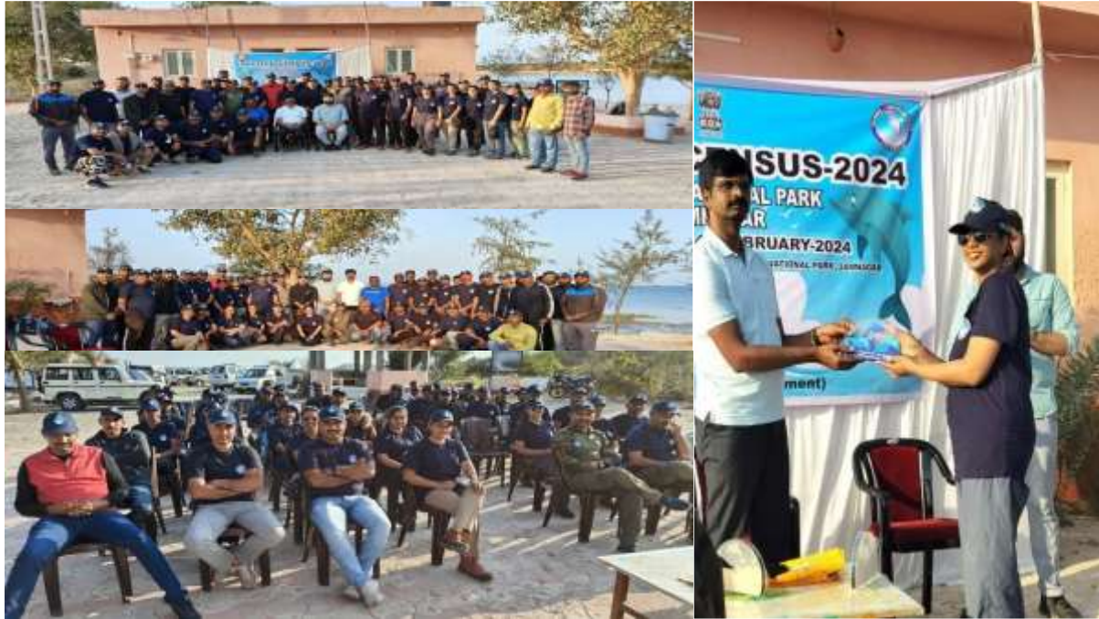
Figure 2. A glimpse of Dolphin Census 2024 with Gujarat Forest Department

On 1 st – 3 rd February 2024 the Gujarat Forest Department conducted a three-day Dolphin Census and WII research team participated as a technical person and helped to collect information.