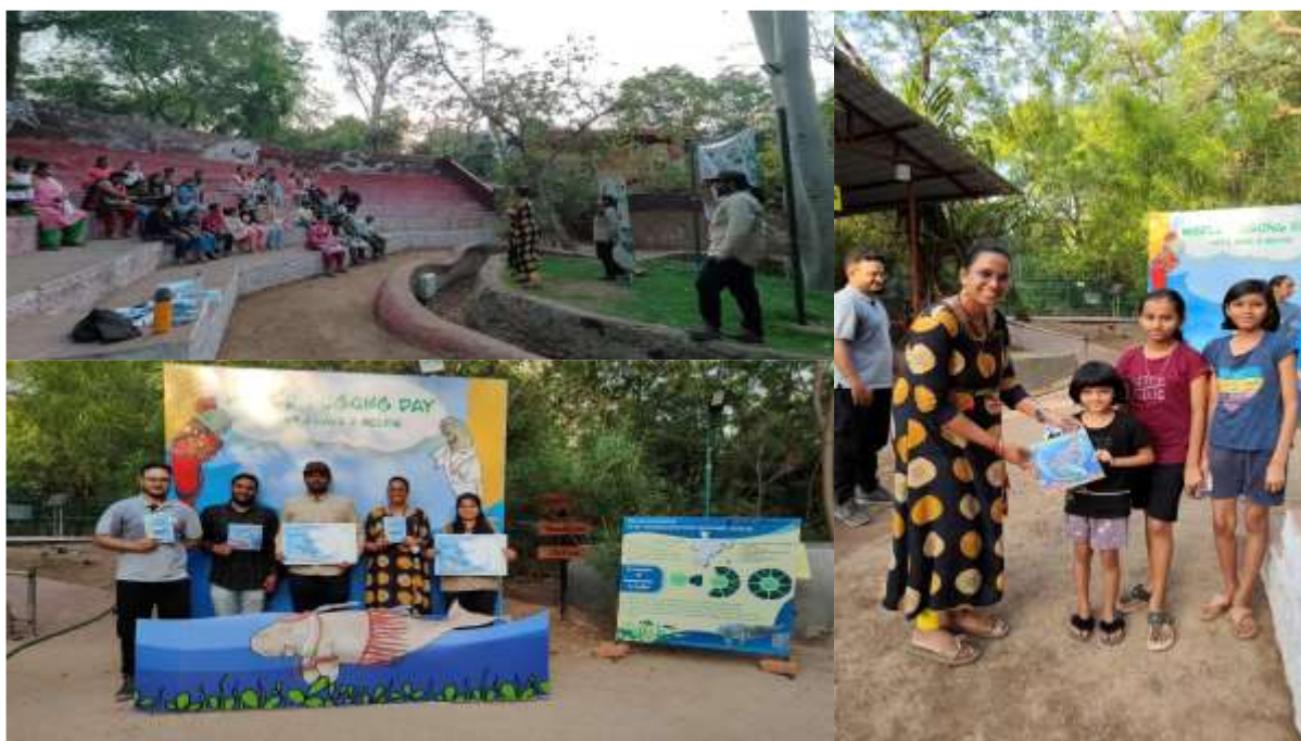
Figure 6. Glimpse of Interaction with locals, students, & kids for World Dugong Day 2024