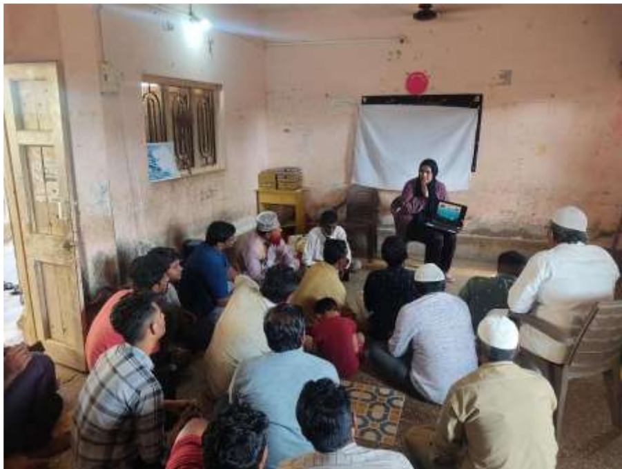
Figure 5. Glimpse of Community Interaction and Awareness program with the fishermen community at Salaya village

On 25 th May 2024, a special community interaction awareness program with Salaya town's fisheries association presidents and boat heads was organized on 25 th May 2024. Ecological services and life histories of Dugong and their forage were discussed. Ecological roles of Seagrasses and go-slow areas near the community's fishing ground were communicated. The members of the community took a special interest in the Seagrass herbariums, pointing to the parallels in the life history of Seagrasses and some commercially valuable fishes.