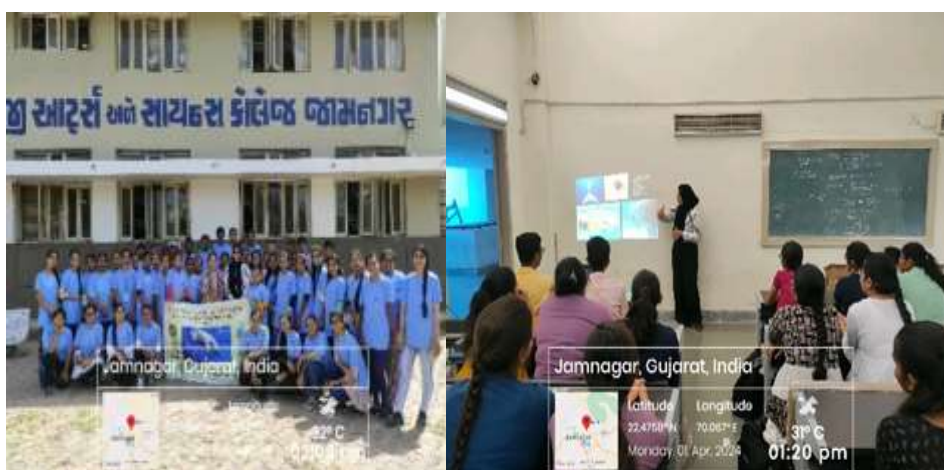
Figure 4. Glimpse of Awareness program with DKV College Students

On 1 st April 2024, an elaborate talk was given to the students regarding the insular/coastal habitats of Dugongs in the Gulf of Kutch. The effects of wastewater discharge, and microplastics as pollutants were discussed. Methods used for mapping Seagrasses and Dugong habitats were also discussed. The students pledged their role in the conservation and awareness of Dugongs and their habitats and further expressed participation during Dugong Day events.