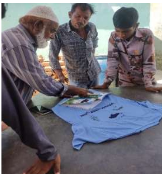
Figure 3. Glimpse of interaction with fishers